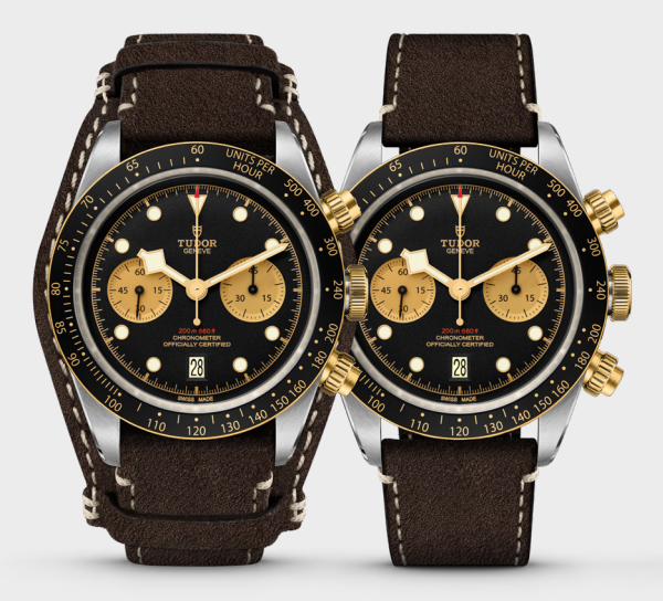
Swiss price (VAT incl.) CHF 5,350.-