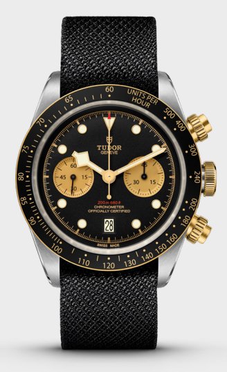
Swiss price (VAT incl.) CHF 5,350.-