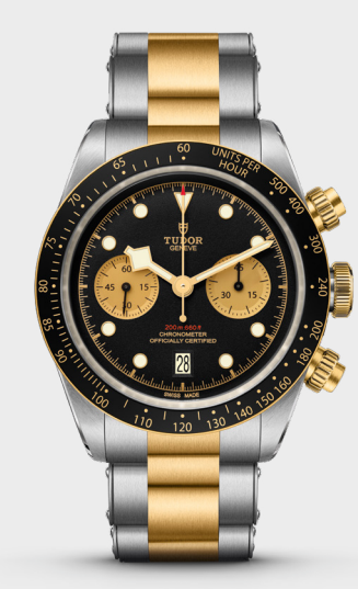
Swiss price (VAT incl.) CHF 6,500.-