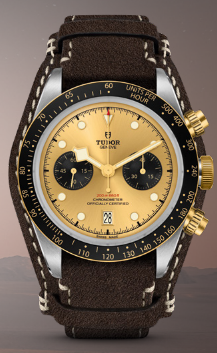
Swiss price (VAT incl.) CHF 5'700.–