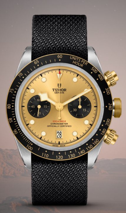
Swiss price (VAT incl.) CHF 5'700.-