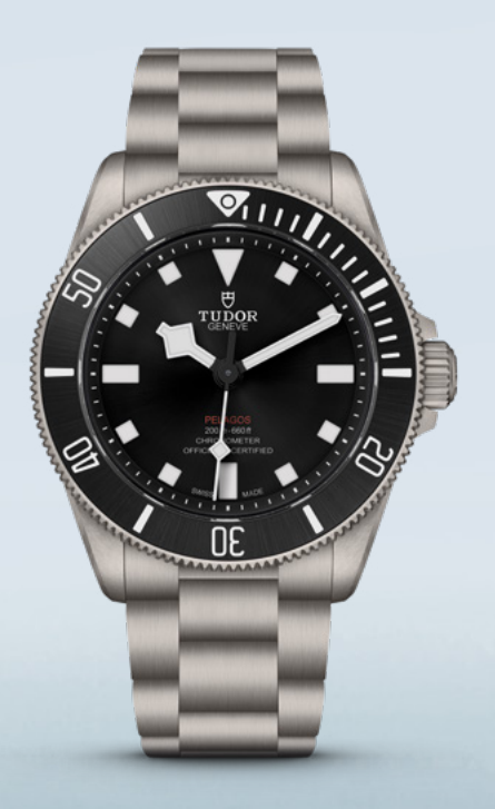
Swiss price (VAT incl.) CHF 4'200.-