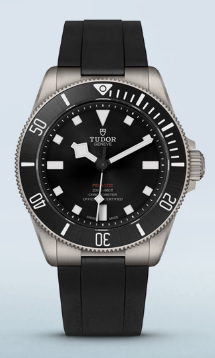
Rubber strap included in the box