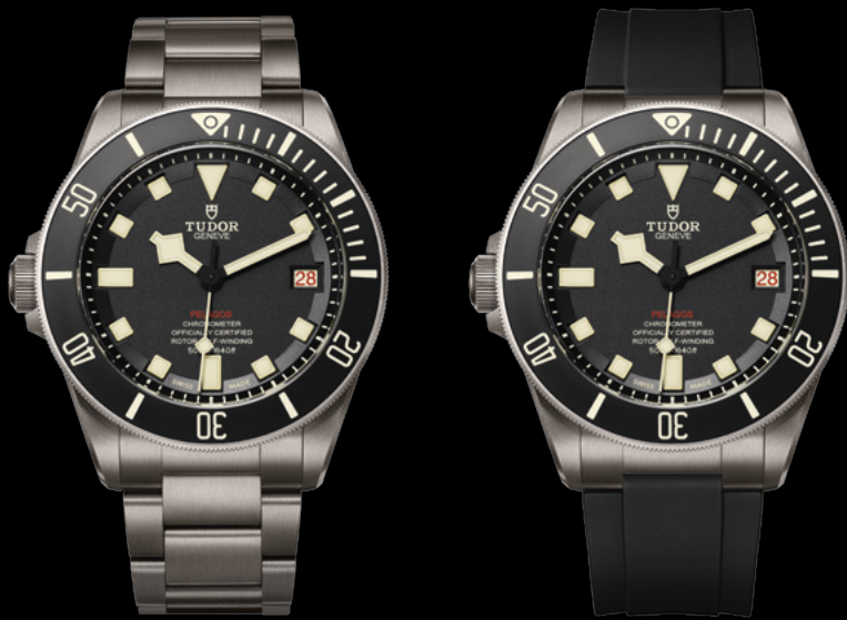
TUDOR PELAGOS LHD REFERENCE 25610TNL